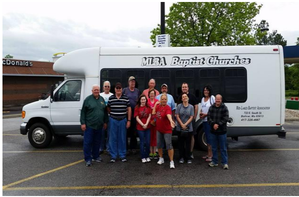
Angola Prison Mission Team.