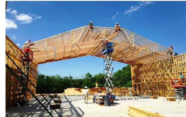
Wow, they are trucking along on putting up trusses!

We need to hear from you if you are planning to go so we can figure out the travel and insurance arrangements.