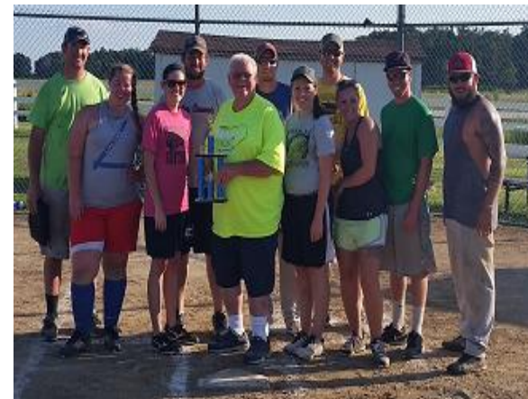
Softball Tournament Winners MLBA CAMP

Cookies, Cookies, Cookies and More Cookies