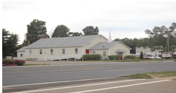
Picture of Amazing Grace Baptist Church

We are going to be putting on a Metal Roof, Minor repairs to church and painting. This is our family Mission trip so children will be able to attend. We have discounts for family members who travel with their parents and we hope to be a part of their VBS or Backyard Bible Club