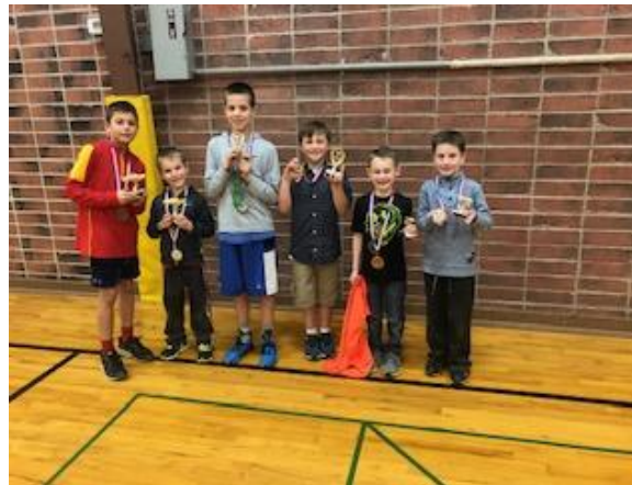
The Winners! 1 st , 2 nd , and 3 rd ! In 2- Division of 2 nd grade and under and 3 rd grade and up.