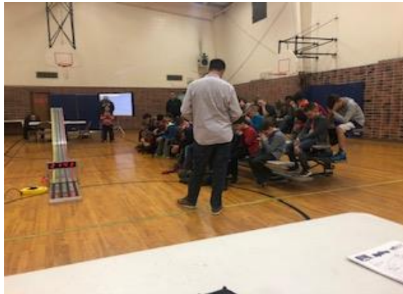
Devotion after the Races by Brady Vestal