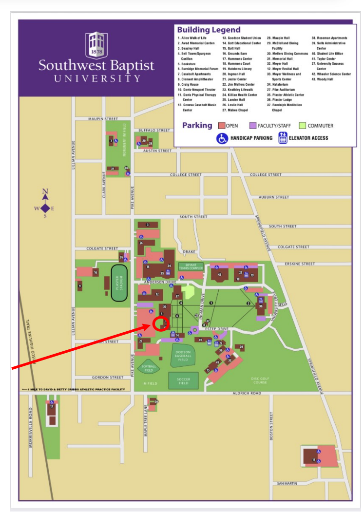
MLBA Executive Board Meeting Tuesday, January 11th

Our Missions Committee, and our Associational Council will meet Thursday, January 6th, before our January 11th Executive Board Meeting to see what this next year might look like. Our Executive Board Meeting is set for Tuesday, January 11th at 7 PM at SBU in the Kaldi's Coffee Shop area located within the Student Union. Check the map for directions.