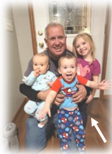
My three new little Mexico Missionaries!