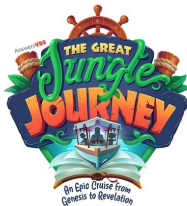
Answers In Genesis