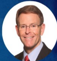
TONY PERKINS PRESIDENT, FAMILY RESEARCH COUNCIL