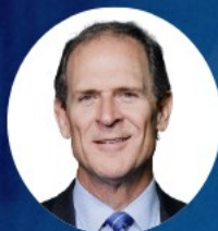
WILLIAM FEDERER HOST OF THE AMERICAN MINUTE RADIO FEATURE